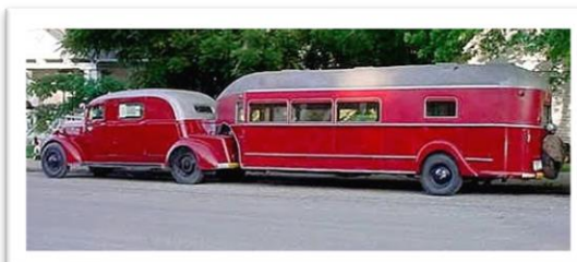
The original units cost between $500 and $1000 and came in a variety of different shapes and sizes.

with what people wanted, providing similar comforts to those available in the home. Some of the early manufacturers to the RV industry are still around today. Among the original makers of recreational vehicle models were Ford, Winnebago, and Airstream. Airstream began to produce their trailers in the early 1930s. Airstream RVs earned a loyal following that continues to this day.